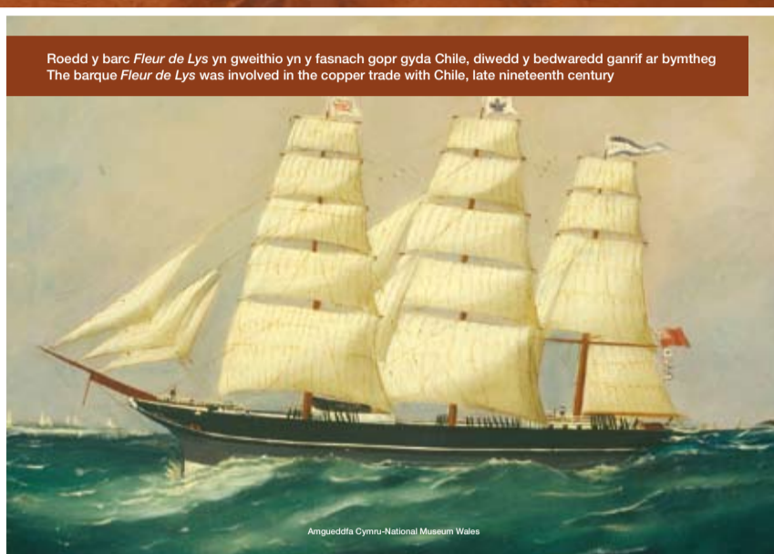
Roedd y barc Fleur de Lys yn gweithio yn y fasnach gopr gyda Chile, diwedd y bedwaredd ganrif ar bymtheg The barque Fleur de Lys was involved in the copper trade with Chile, late nineteenth century