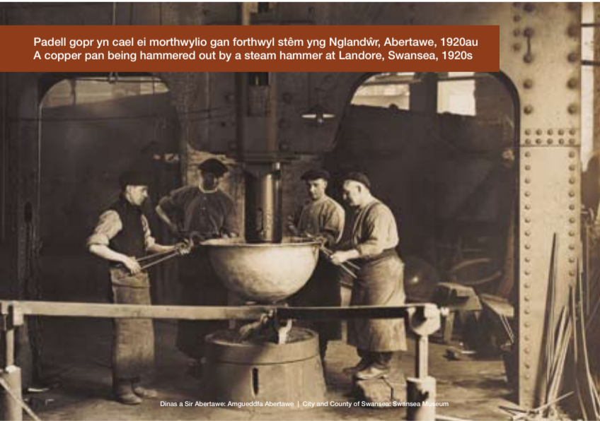
Padell gopr yn cael ei morthwyllo gan forthwyl stêm yng Nglanŵr, Abertawe, 1920au A copper pan being hammered out by a steam hammer at Landore, Swansea, 1920s

Dinas a Sir Abertawe: Amgueddfa Abertawe | City and County of Swansea: Swansea Museum